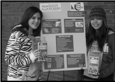
Student tagging at Market Basket on Amherst Street, Nashua