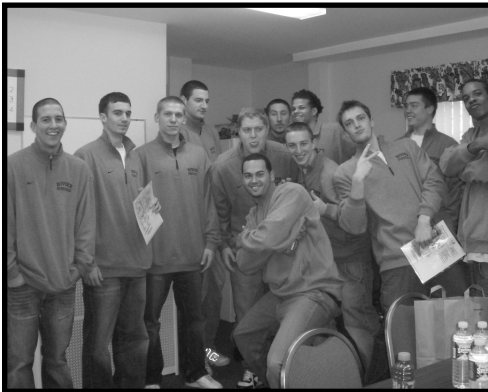
Bottom Photo - Rivier athletes getting ready to Penny Pick in the neighborhoods