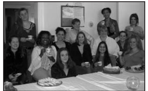
Mothers from the Transitional Housing Program

Transitional Housing Program to celebrate their accomplishments. Lavender, peach and citrus green teas were sipped out of dainty china tea cups provided by the Cozy Tea Cart of Brookline, NH, as each one of the mothers