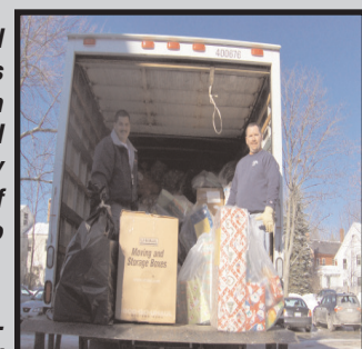
BAE gift delivery day! Employees provided toys for over 400 children.

I want to thank you from the bottom of my heart - thank you! What you have done for my children is so indescribable, so thoughtful, and generous. Please know that you are special, and whoever you are I will thank you on Christmas day when my children open those gifts. We thank you!"