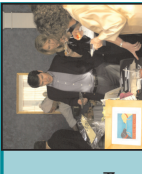
Guests enjoying the gourmet cuisine and silent auction

The Nashua Country Club once again provided the venue for our 20th Annual Gourmet Festival and Auction. The chefs pictured below generously donated their time and talent to present quite a feast! They included: Bedford Village Inn, Celebrations Distinctive Catering, Checker's Restaurant, Creative Cakes by Debby, Fody's Great American Tavern, Greenhouse Café Catering, Michael Timothy's Surf/Buckley's Great Steaks, Nashua Country Club, New England Coffee, Patisserie Bleu, Pine State Beverage Co., Swan Chocolates, The Common Man of Merrimack, The Saffron Bistro, The Seeding Café, Unums, Villa Banca, and You You Japanese Bistro.