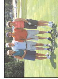
One of our very happy, but hot foursomes